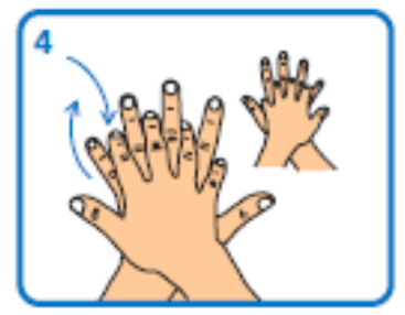
Rub back of each hand with palm of other hand with fingers interlaced