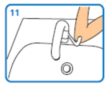
Use elbow to turn off tap